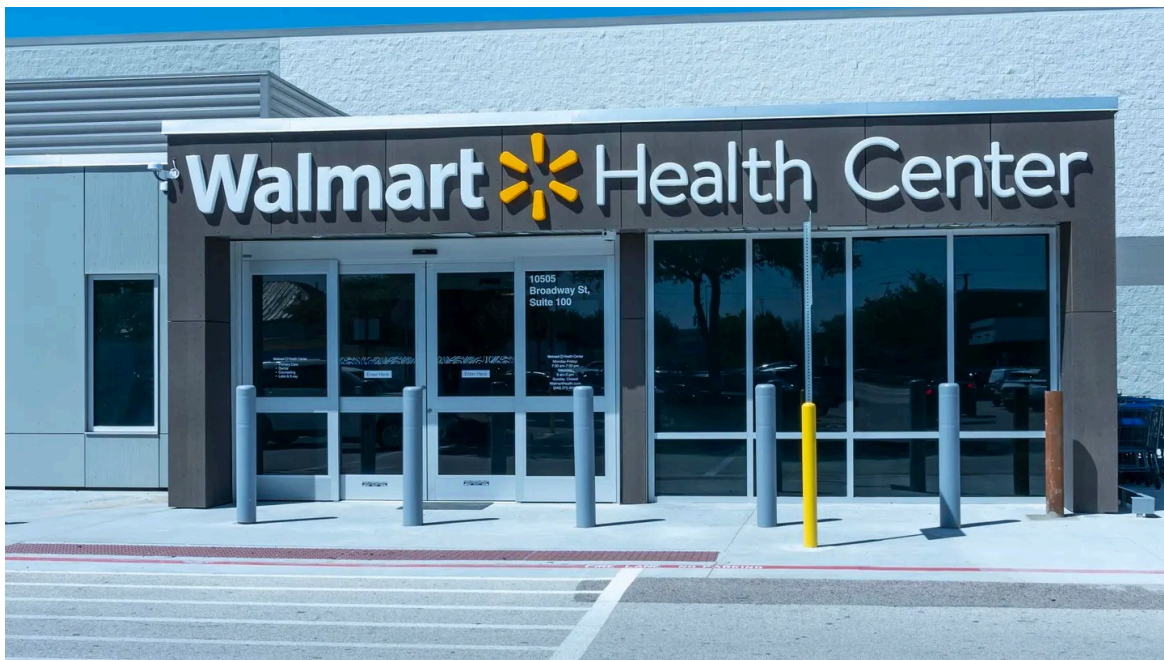
Pearland, Texas, USA - April 3, 2024: A Walmart Health Center in Pearland, Texas, USA.

Walmart decided to close their 51 health care clinics because of high operating costs. I regret that they made this move, since I understand that there are many rural areas in the United States where health care is not available. In particular, there is a need for urgent care centers to see people that need immediate attention, but don't have a condition that warrants going to a hospital.